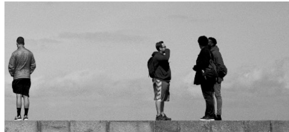
Brandon Forrest Frederick, Untitled, to be displayed on the west-facing billboards

The west-facing billboards display images of work by artist, Brandon Forrest Frederick. In selecting these images, Frederick wanted to offer the viewer a "space of contemplation. He explains, "This image acts to strip these individuals from the landscape they inhabit, while focusing on their humanistic relationship to each other. The repurposing of the advertisement space with this abstracted view of public life is a means to open a discussion on how we interact with each other on a daily basis. It usurps the nature of the advertisement, in how it works against our undivided presence in the spaces we inhabit."