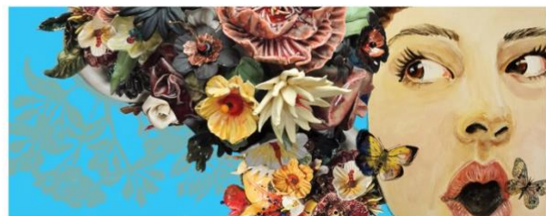
(Bernadette Torres, 2018 Artboards selection)